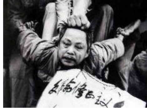
A dossier photo showing the attack and denouncement of a “counterrevolutionary” by the CCP activists.

The 55-year history of the Chinese Communist Party (CCP) is written with blood and lies. The stories behind this bloody history are both extremely tragic and rarely known. Under the rule of the CCP, 60 to 80 million innocent Chinese people have been killed, leaving their broken families behind. Many people wonder why the CCP kills. While the CCP continues its brutal persecution of Falun Gong practitioners and recently suppressed protesting crowds in Hanyuan with gunshots, people wonder whether they will ever see the day when the CCP will learn to speak with words rather than guns.