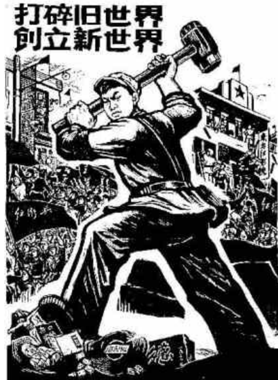
Poster promoting Red Guards’ beating people, destroying properties, and raiding homes. The slogan in the picture says, “Smash the old world; build a new world.”

But the Communist Party promotes “humans over nature” and a “philosophy of struggle” in defiance of heaven, the earth, and nature. Mao Zedong said, “battling with heaven is endless joy, fighting with the earth is endless joy, and struggling with humanity is endless joy.” Perhaps the