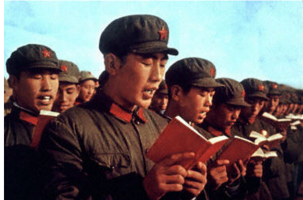
The Cultural Revolution was a time period in which “the Sun is the most red” while “the world is the darkest.” Everybody had to study Mao's works.

The collapse of the socialist bloc headed by the Soviet Union in the early 1990s marked the failure of communism after almost a century. However, the CCP unexpectedly survived and still controls China, a nation with one fifth of the world's population. An unavoidable question arises: Is the CCP today still truly communist?