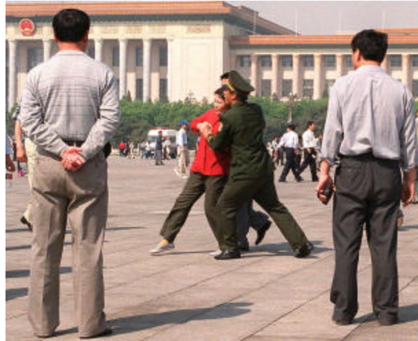
Police making arrest of Falun Gong practitioners who peacefully appeal on the Tiananmen Square on May 11, 2000.