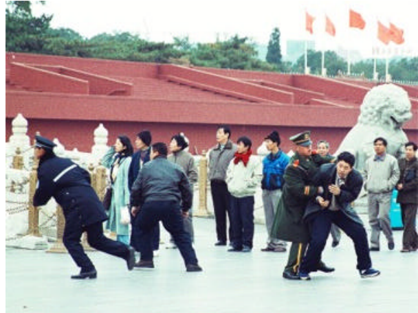
Tyranny caught on camera: Chinese uniformed and plainclothes police arrest approximately 10 Falun Gong practitioners, who had come to Tiananmen Square to appeal peacefully for an end to the persecution, November 9, 2000.

When speaking about tyranny, most Chinese people are reminded of Qin Shi Huang (259-210 B.C.), the first Emperor of the Qin Dynasty, whose oppressive court burnt philosophical books and buried Confucian scholars alive. Qin Shi Huang's harsh treatment of his people came from his policy of "supporting his rule with all of the resources under heaven." [1] This policy had four main aspects: excessively heavy taxation; wasting human labor for projects to glorify himself; brutal torture under harsh laws and punishing even the offenders' family members and neighbors; and controlling people's minds by blocking all avenues of free thinking and expression through burning books and even burying scholars alive. Under the rule of Qin Shi Huang, China had a population of about 10 million; Qin's court drafted over 2 million to perform forced labor. Qin Shi Huang brought his harsh laws into the intellectual realm, prohibiting freedom of thought on a massive scale. During his rule, thousands of Confucian scholars and officials who criticized the government were killed.