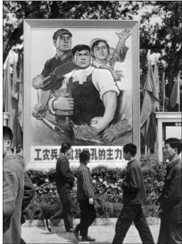
A poster from the "Criticizing Lin Biao and Confucius" campaign

Although the Chinese nation has experienced invasion and attack many times in history, the Chinese culture has shown great endurance and stamina, and its essence has been continuously passed down. The unity of heaven and humanity represents our ancestors' cosmology. It is common sense that kindness will be rewarded and evil will be punished. It is an elementary