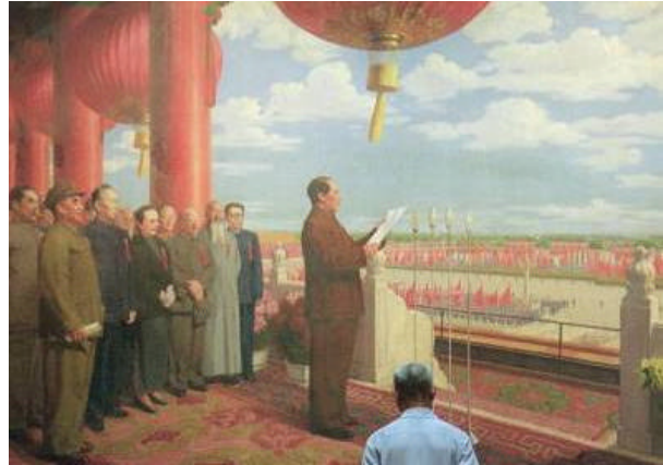
A Chinese man looks at a painting of Chinese communist leader Mao Zedong declaring the formation of the People's Republic of China on the gate of the Forbidden City in 1949. Despite the Chinese Communist Party's claims to the contrary, the history of the CCP has been filled with the blood of innocents and deceit.

According to the book Explaining Simple and Analyzing Compound Characters (Shuowen Jiezi) written by Xu Shen (d. 147 AD in the Eastern Han Dynasty), the traditional Chinese character Dang , meaning “party” or “gang,” consists of two radicals that correspond to “promote or advocate” and “dark or black” respectively. Putting the two radicals together, the character means “promoting darkness.” “Party” or “party member” (which can also be interpreted as “gang” or “gang member”) carries a derogatory meaning. Confucius said, “A nobleman is proud but not aggressive, sociable but not partisan.” The footnotes of Analects (Lunyu) explain, “People who help one another conceal their wrongdoings are said to be forming a gang (party).” In Chinese history, political cliques were often called Peng Dang (cabal). It is a synonym for “gang of scoundrels” in traditional Chinese culture and is associated with the implication of ganging up for selfish purposes.